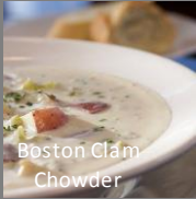
Boston Clam Chowder