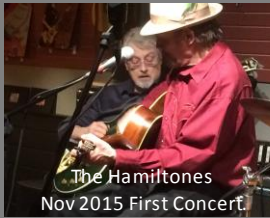
The Hamiltones Nov 2015 First Concert.