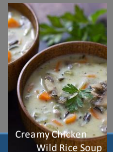
Creamy Chicken Wild Rice Soup