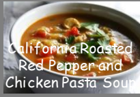
California Roasted Red Pepper and Chicken Pasta Soup